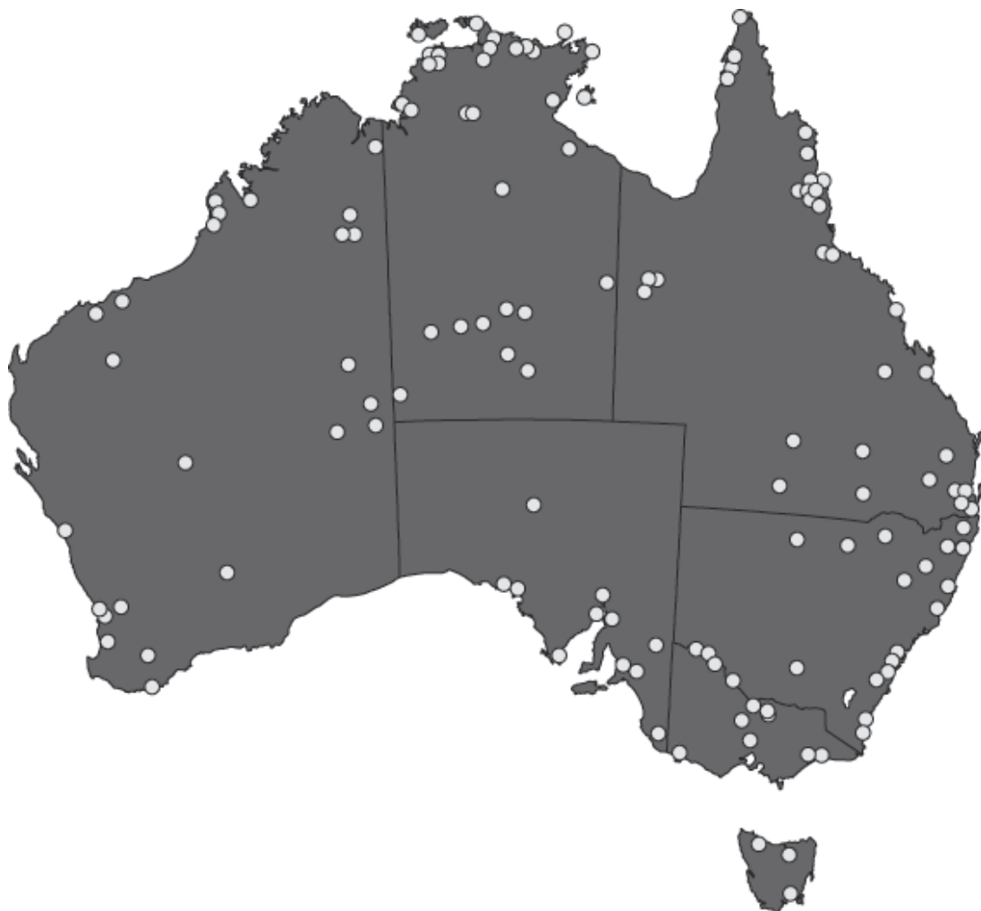
Figure 1. Map showing general location of health services participating in the QAAMS program.

The performance of the QAAMS Program services is now meeting the desired analytical goal of 3% set by the Australian Government for PoCT HbA 1c analysers. 3